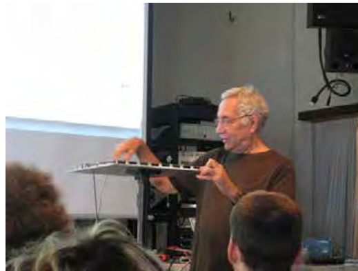
Figure 3 The Slabs on collapsible stand

the possibility of trapped air. An important part of this new case is that it extends sufficiently beyond the back of the instrument to allow for the cables required to configure the instrument to be permanently installed and attached to the case. This relieves wear and tear on cables and connectors and keeps the controller correctly wired to the other components of the instrument. The case includes a shelf below the Slabs to store the DAC, laptop and power supplies. Strong handles are provided so that the entire instrument can be carried from its shelf in CNMAT’s musical instrument and controller library to nearby studios for exploratory performance.